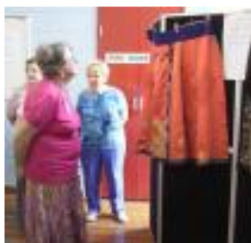
Viewing a skirt with gold wrapped thread couching and couched kingfisher feathers.

The talk by Judith Rutherford on Chinese Women's Dress: Delicate Hands, Delicate Feet held in the Ultimo Community Centre on 25 and 26 November 2006 was, unfortunately, very poorly attended. This was disappointing as the talk itself was extremely interesting, and the display of garments, ornaments and accessories attracted a great deal of attention from those there. Judith's explanation of what the embroidery, the styles of dress, the symbolism of the animals, flowers and insects involved, the types of dyes used in the threads and tassels, and the changes in the style of garments over time, was fascinating. From this point of view the function was a success, but from the point of view of attendance it was not. Perhaps it was held too near Christmas when everyone was too busy with Christmas parties and preparations!